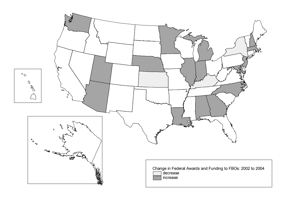
Figure 1. States Where Both Federal Funding and Awards Increased/Decreased to FBOs: 2002 to 2004

While half of the states had decreases in <u>funding amounts</u> to faith-based organizations from 2002 to 2004, only a few had any significant decreases in the <u>number of grants</u> awarded to faith-based organizations (Figure 2). In fact, three-quarters of the states had increases in the number of awards going to faith-based organizations.