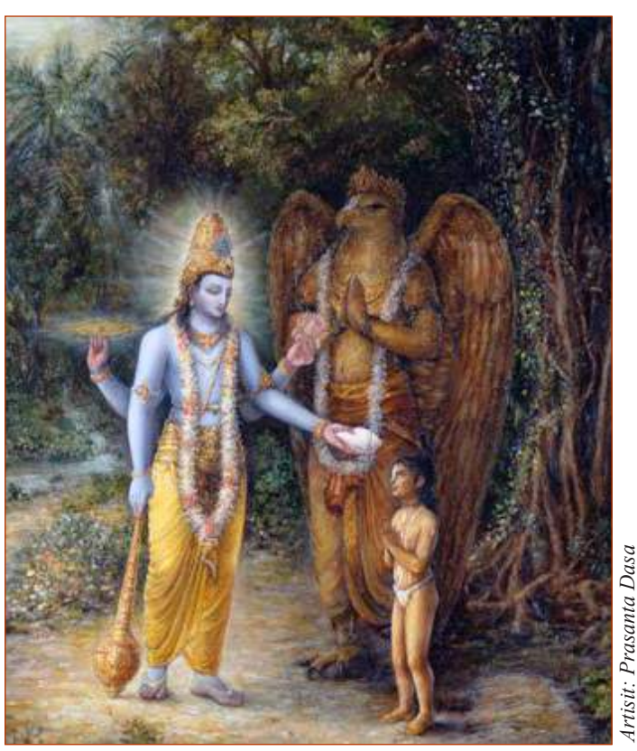
annihilated, even during the time of dissolution, offered his deliberate and conclusive prayers.

dhruva uvāca yo 'ntaḥ praviśya mama vācam imām prasuptām sañjīvayaty akhila-śakti-dharaḥ sva-dhāmnā anyāmś ca hasta-caraṇa-śravaṇa-tvag-ādīn prāṇān namo bhagavate puruṣāya tubhyam